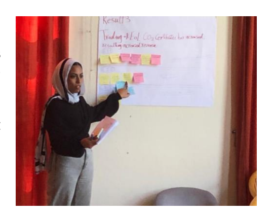
An agricultural advisor plans her assignments

The Egyptian Biodynamic Association (EBDA) was founded in 1990 as part of the SEKEM initiative (see About Us - SEKEM), formally registered as a non-profit organisation with the Ministry of Social Affairs in 1996 and it is the oldest association in Egypt supporting farmers in the transition from conventional to regenerative and organic agriculture.